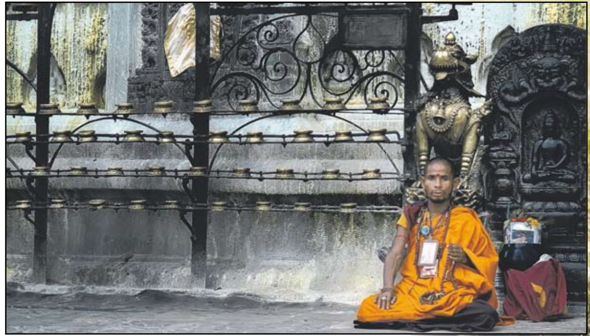
SPIRITUAL: A Buddhist monk in Nepal.