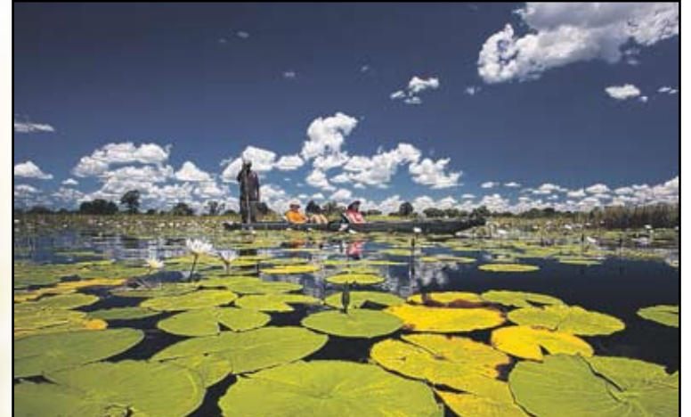
RELAXING BOAT RIDE: The Okavango Delta in Botswana.