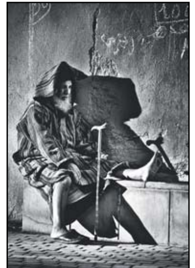
AMAZING PEOPLE: Left, a Merci tribeswoman in Ethiopia. Right, an elderly man in Marrakesh, Morocco.